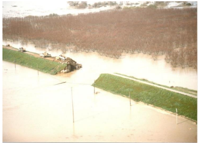
Levee break – rock filling. Marysville Maintenance and Shop 3 are to the left.