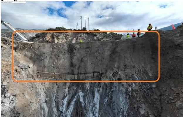
State Route 39 at post mile 32.75. Concrete retaining wall on slope etched and dyed to match environment.

Here are some photos of recent Caltrans projects: