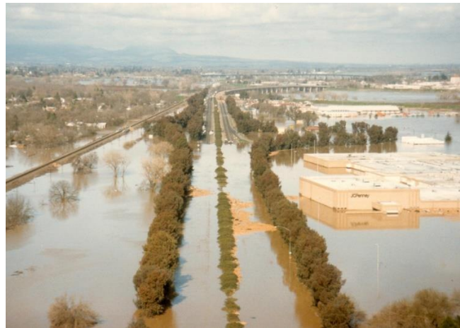
Hwy 70 looking north. The Mall on the right. Marysville Maint and Shop 3 are just north of Mall.