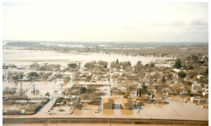
Flooded area of Linda/Olivehurst.