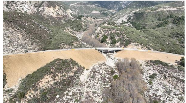
State Route 39 at post mile 31.27. Slope reconstructed and new drainage installed.